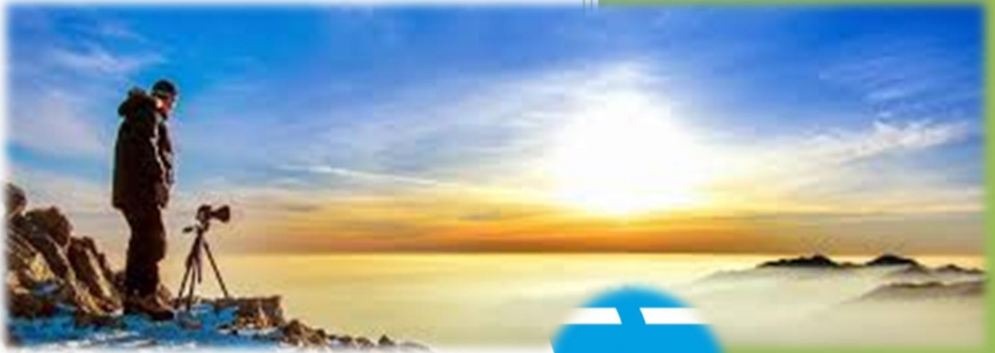
Finding innovative solutions